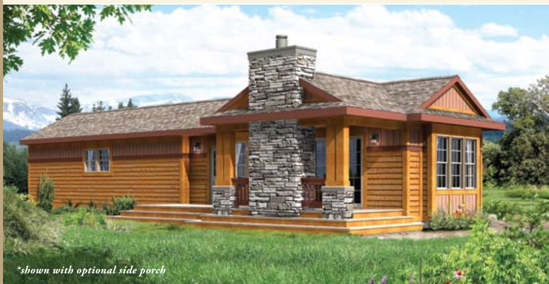
*shown with optional side porch

*optional side porch, fireplace and deck built by others